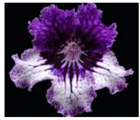
Streptocarpus TsF Gisele