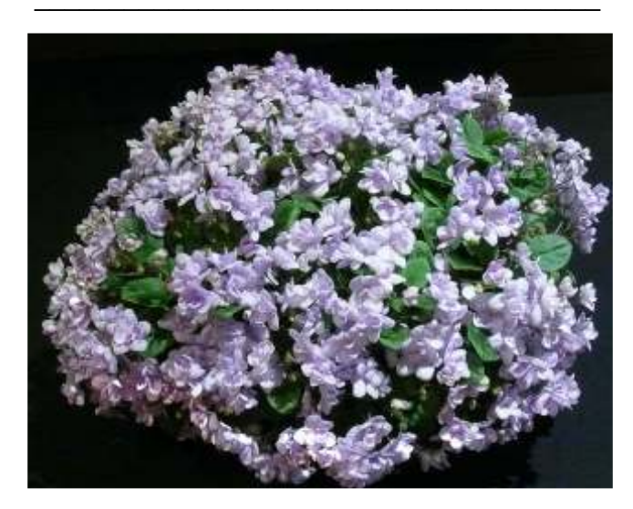
Rob's Boolaroo