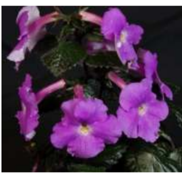
'Texas Blue Bayou'