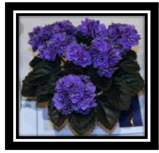
Ness' Crinkle Blue