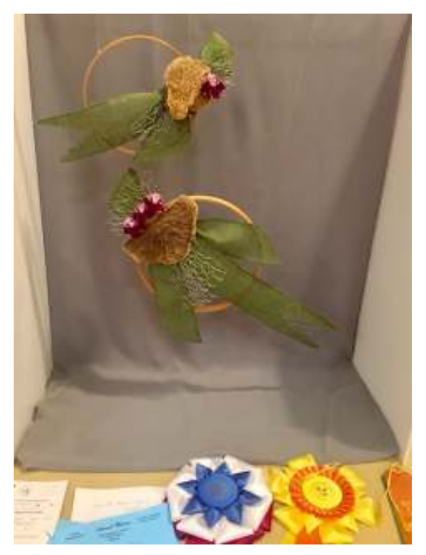
This Best Design, not mine, deserved its awards

In time I learned about frogs and Oasis and floral glue and those wonderful, blessed hot glue guns. I attended a Dixie convention in Memphis, but I didn't exhibit. I remember a certain gentleman presenting a program on design. Something about his manner challenged me, and I made up my mind right then and there I was going to beat him out of a Best in Class one day.