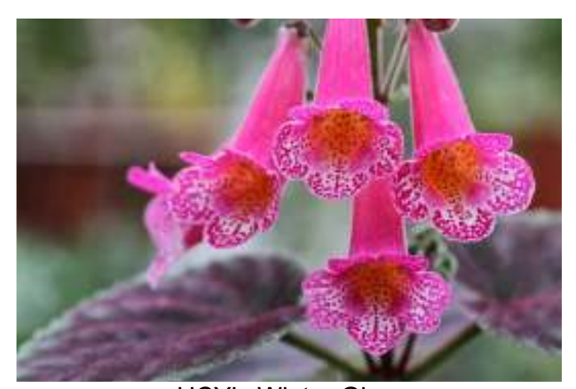
HCY's Winter Glory

remove the lower set of leaves. Place the cutting in a pot of fresh soil with the leaf nodes down far enough in the pot that the soil is nearly up to the leaves that are remaining on the stem, water it, and seal the whole thing in a plastic bag. In a couple weeks, the cutting should be rooted and the bag can be removed. Now you have a shorter plant that will fit – and bloom – under your lights. I've also used this method with my Kohlerias. When I grew the species Smithiantha zebrina in the greenhouse, I found that it needed the weight and support of being potted in a clay pot because it was too top-heavy in a plastic pot when left to grow to its natural height.