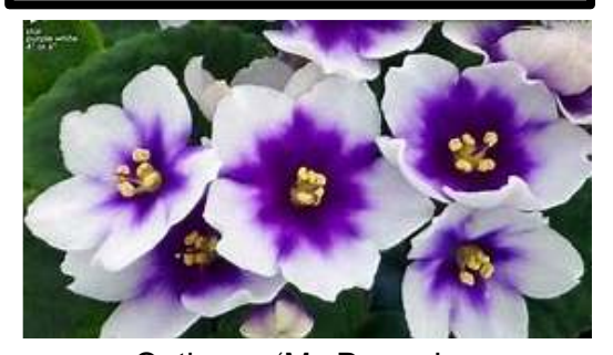
Optimara 'My Dream'