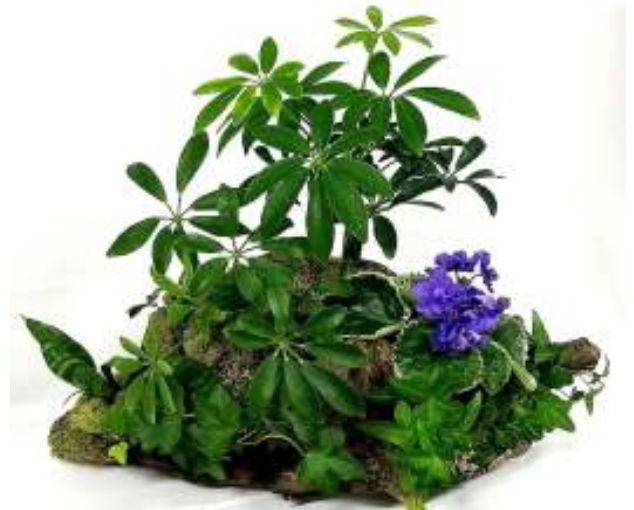
Container Garden Becky McMeel, Sundowners AVS, LA