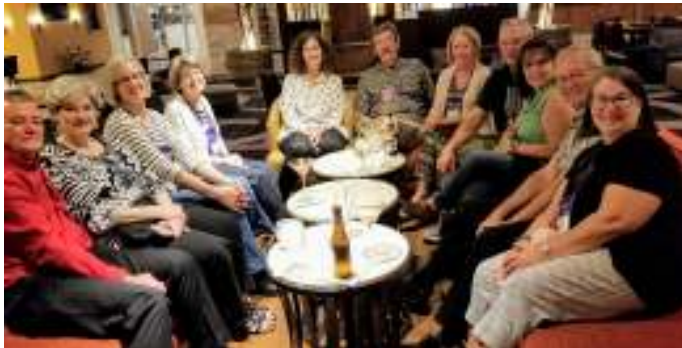
Sweet memories of Sundowners at the 2019 AVSA Convention

brown bag lunch social. We were so excited to see each other -- pictures went by the wayside.....so any pictures you see are from prior meetings. There were lots of hugs and hugs and hugs to go around! Has your club started in-person meetings yet?