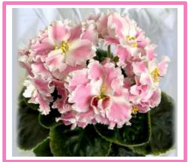
Rozovaia Akvard by Pamela van Durme Tampa, AVS (AVSA 2021 Convention)