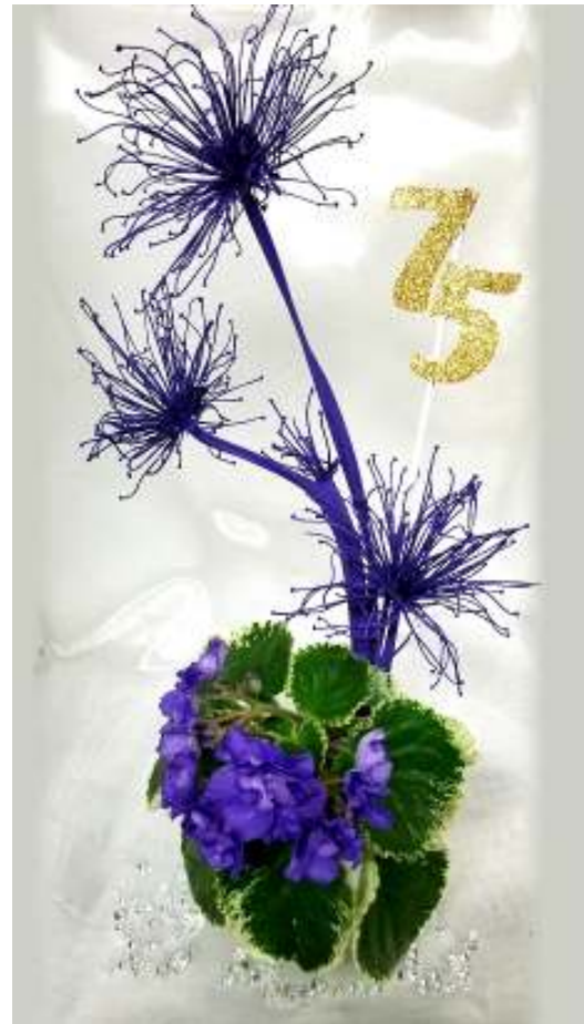
"75 th Anniversary Celebration" by Becky McMeel AVSA 2021 Cyber Convention