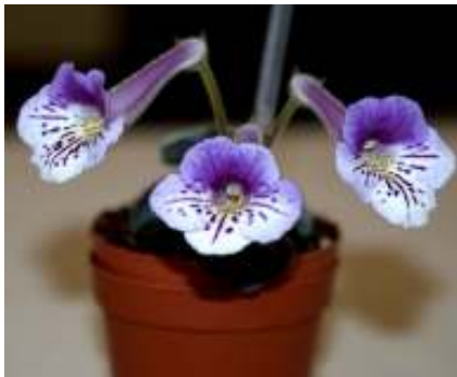
Sinningia 'Ozark Purple Zebra'

Tuberous: Sinningias. Among the sinningias you might choose for your plantings, you will most likely want to stay with miniature varieties unless you have a very large terrarium or dish garden. Among the most faithful of the sinningias are these hybrids, S.