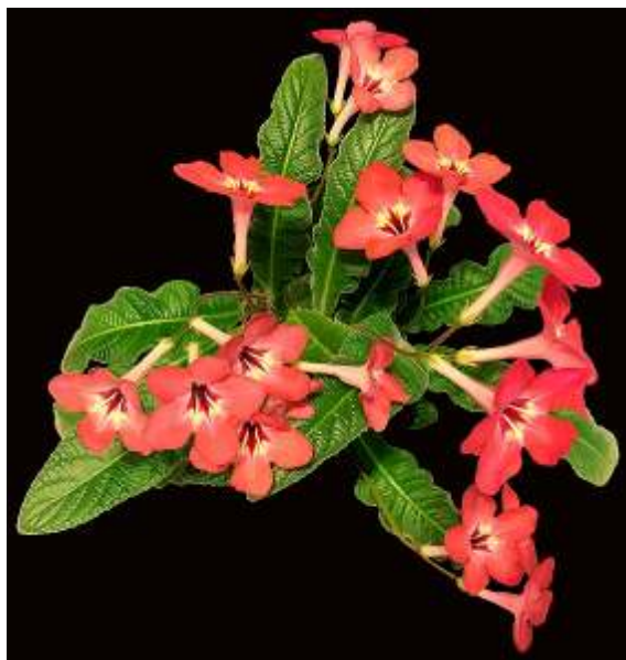
Streptocarpus 'Salmon Sunset' Terry Jordan, AVSA 2021 Cyber Convention

Respectfully and keep up the good growing, Robbie McMeel