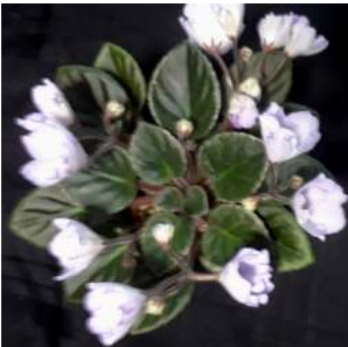
Rob's Pewter Bells