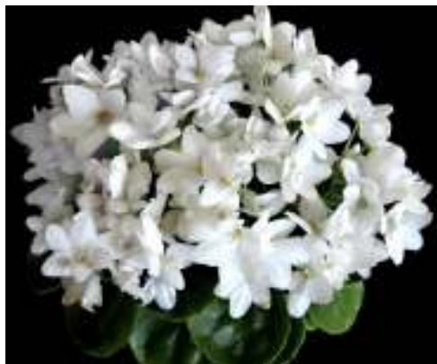
Broadway Star Trail

It does, after all, take a colony to raise an intelligent plant.