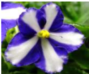
AV Chimera Misbehavin'

COPY DEADLINE FOR NOVEMBER ISSUE October 15