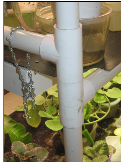
Step 2 Corner Detail

Step 3 - Glue PVC 90 Degree Elbow Connectors to two of the Item 2s for the top light support. Make sure both the PVC 90 Degree Elbow Connectors are parallel to each other.