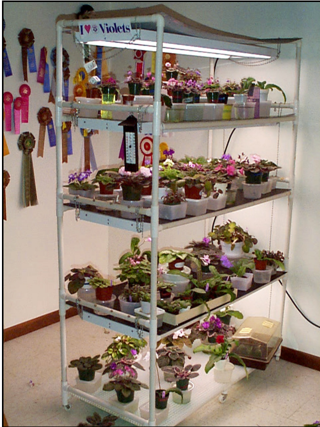
Completed Plant Stand with Individual Watering