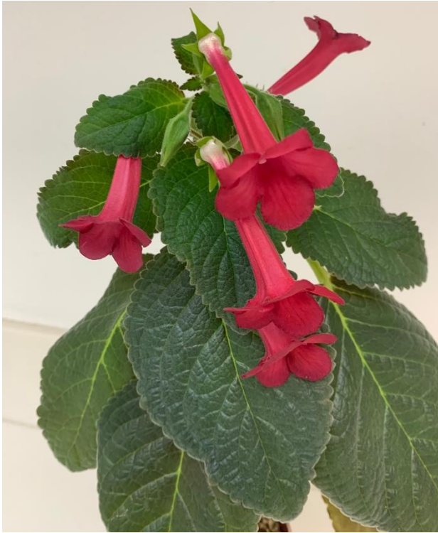
Sinningia 'Prudence Risley'

Prudence Risley Residential College for the Creative and Performing Arts, commonly known as Risley Residential College, Risley Hall, or just Risley, is a program house at Cornell University in Ithaca, NY.