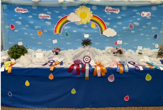
"African Violets Weather It all" winners table