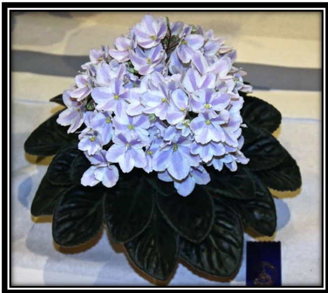
The Alps

Include your name, name of the AVSA-affiliated club holding the show, dates of the show, your complete address (NO P.O. Boxes), and daytime phone number.