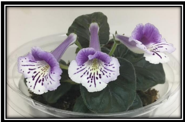
Sinningia 'Party Dude'