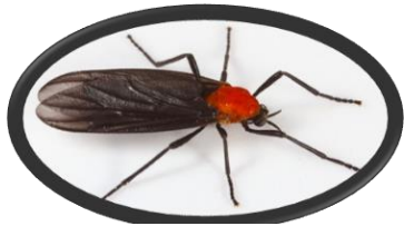
Cajun's Code Blue

Notice that throwing them all in the trash or taking a complete break from your African violet hobby wasn't listed as a remedy. Nor was throwing them into the basement like a harem of Barbies or just slamming the plant room door shut. With a pound of cure, the love bug will soon strike again.