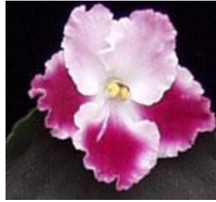
“Tropical Heat Wave”

African Violets, Streptocarpus and Other Gesneriads