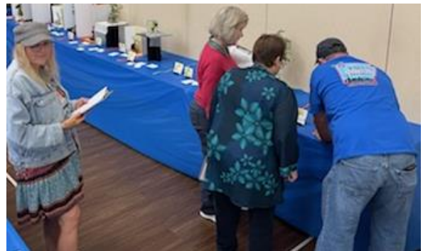
The Judges—scrutinizing my underwater design

But when show time thundered upon us, we scrounged through our shelves and produced enough plants for 100 entries by seven members, including eight designs. As surprising as a Christmas Day snow in the South, an abundance of sale plants appeared on the sales tables.