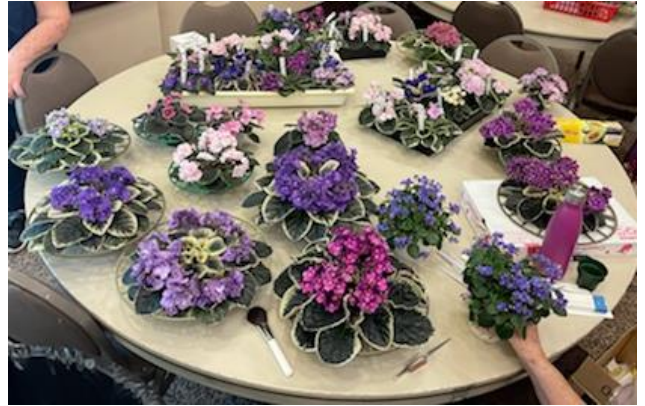
The Grooming Table

from, "None" to "It depends" to "Maybe a few" with one bright response of, "10 or 12. I hope."