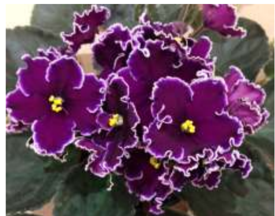
Edge of Darkness