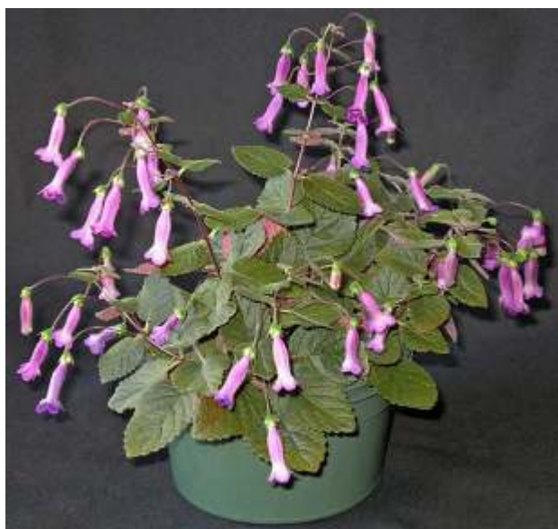
Sinningia 'Deep Purple Dreaming'