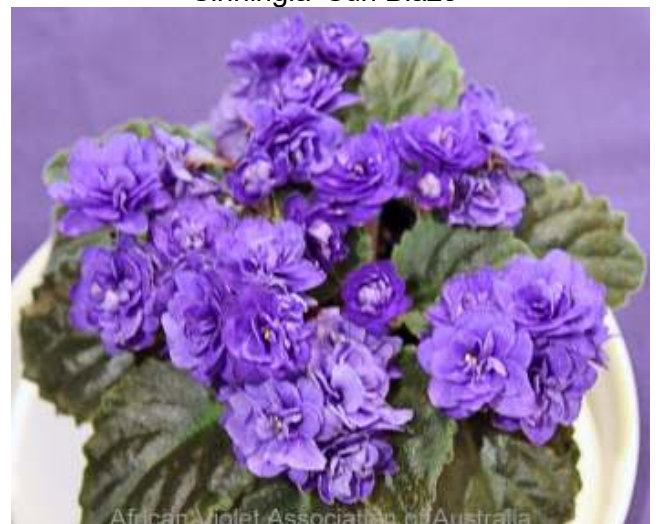
Ness' Crinkle Blue