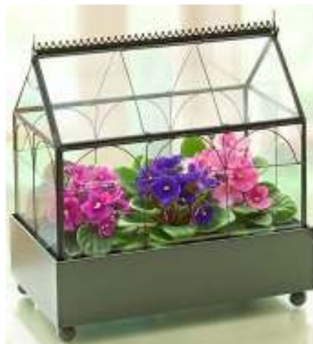
Sample of rectangular container

Unlike a dish garden, a terrarium must have a cover. None of the plant material may reach above the opening.