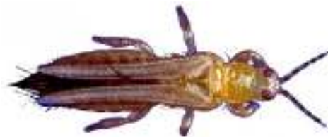
Western flower thrips.

Searches around the world have located no other source of the S. avermitilis bacterium. Although initially the research focus was for an anti-parasite agent for animals, over the years since its discovery avermectin uses have multiplied to include abamectin, a variant we know as Avid.