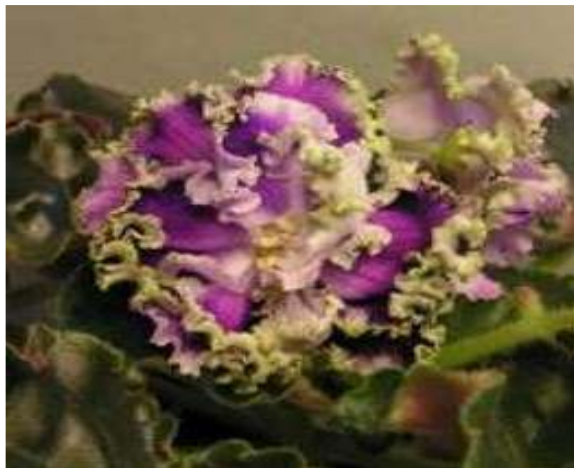
Cajun's Royal Knockout

October 12-15, 2022 - DIXIE AVS Annual Convention & Show, Double Tree by Hilton, Murfreesboro, TN.