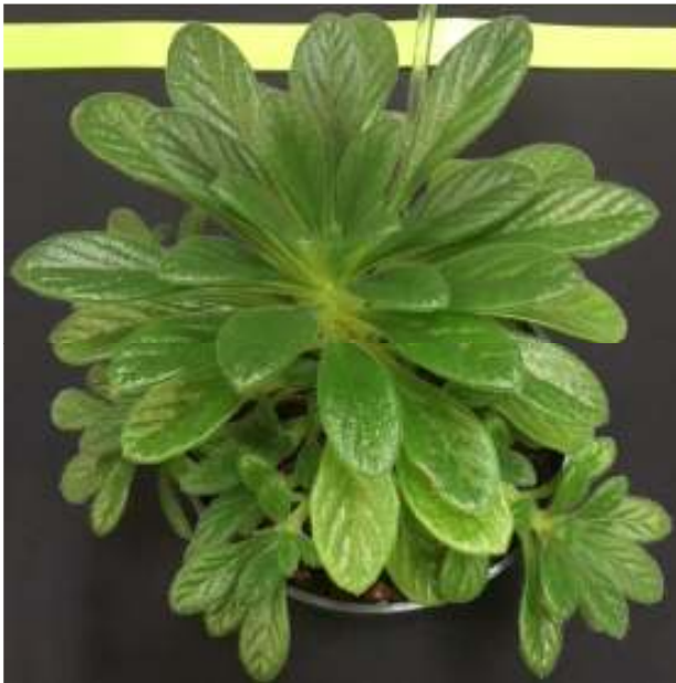
Petrocosmea with stolons

Now I have achieved success with having blooming Petrocosmea plants of several varieties in our living room on the light stand that enjoys the year around temperature control that is comfortable for the home residents. My success story includes P. flaccida , duclouxii and a hybrid, P. 'Momo' created by Nagahide Yamaguchi. It is a cross of P. nervosa x flaccida and has flowers that are slightly larger than either parent. All three of these varieties have purple flowers, grow in a flat, tight rosette, with very "furry" foliage, and have purple flowers. I am also growing species P. kerrii , but it has not yet bloomed for me. It will have blossoms of white or cream with a distinct yellow splotch in the center.