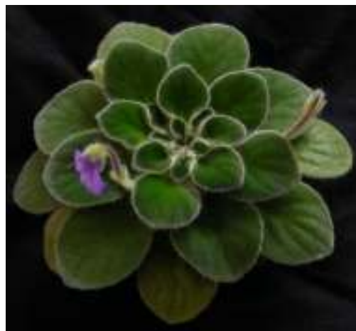
Petrocosmeas are known for their tailored, rosette forming foliage

Would you like a small, rosette gesneriad with attractive foliage? Let me recommend Petrocosmea to you. Petrocosmeas take less space than a semiminature African violet and need less repotting, too. Their name means “ornament of the rocks” and they truly are ornamental, with or without flowers.