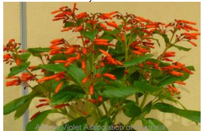
Sinningia 'Sun Blaze'

Cover exposed soil with moss and/or gravel. If you plant your garden 2 or 3 weeks before show, be sure to keep it in a well lighted area and mist it occasionally.