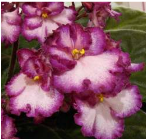
Okie Easter Bunny